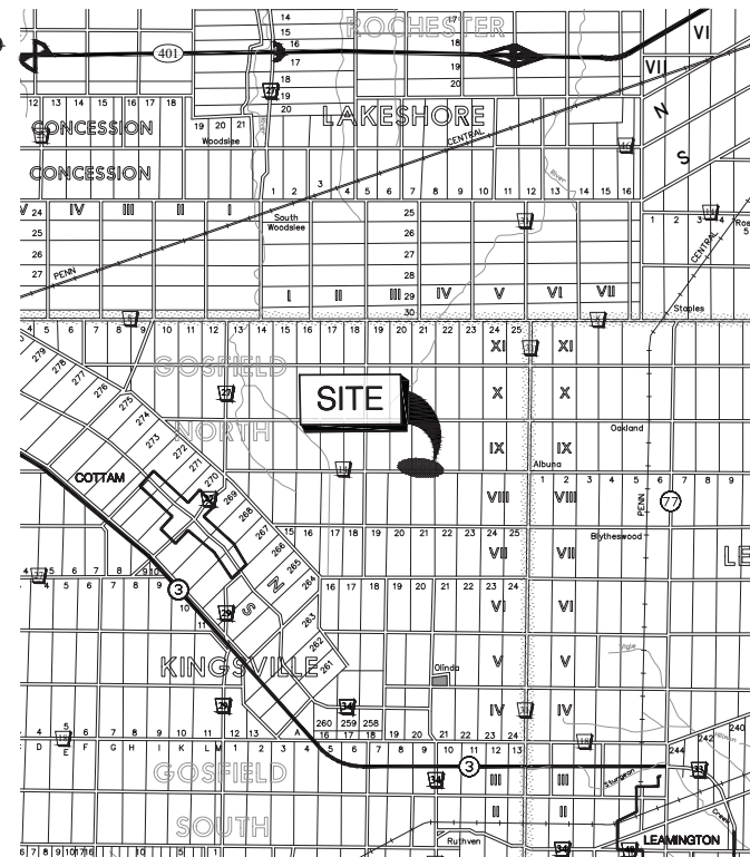
KEY PLAN Scale = 1:100,000