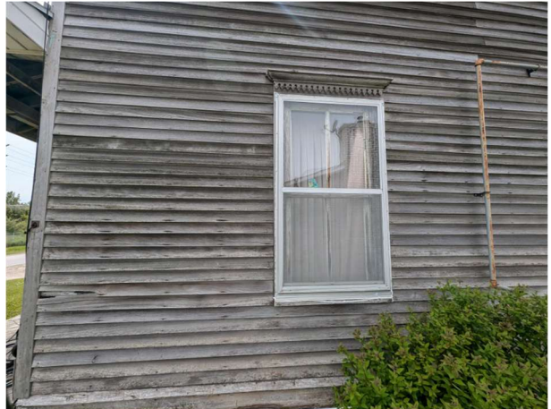
East Window View ( Facing West )