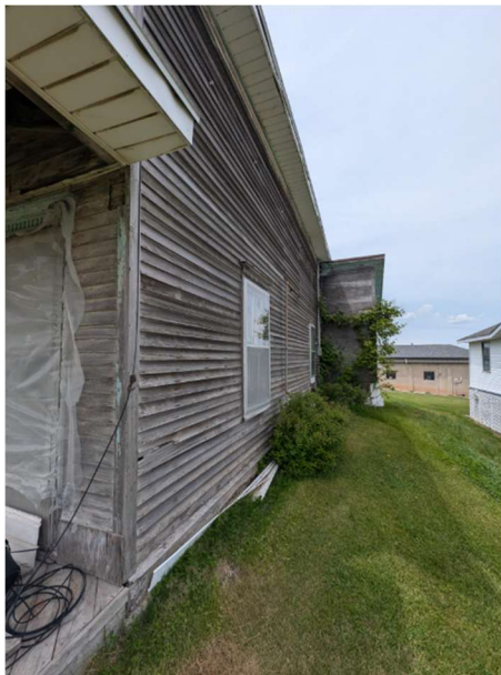
East Side Panel ( Facing North )