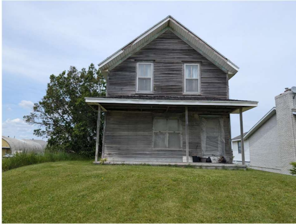
Front View ( Facing North )