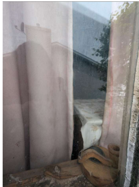
East Window ( Facing West )