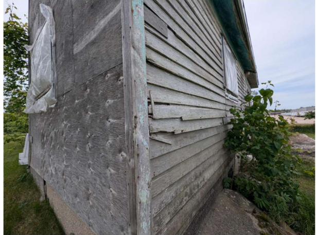
West View ( Facing South-East )