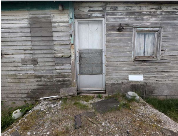
Rear View ( Facing South )