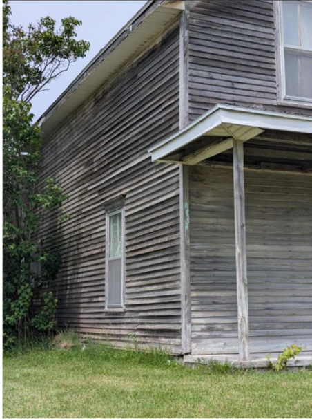
West/Front Side ( Facing North-East )