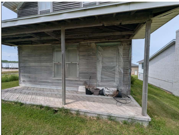
Front Porch ( Facing North )