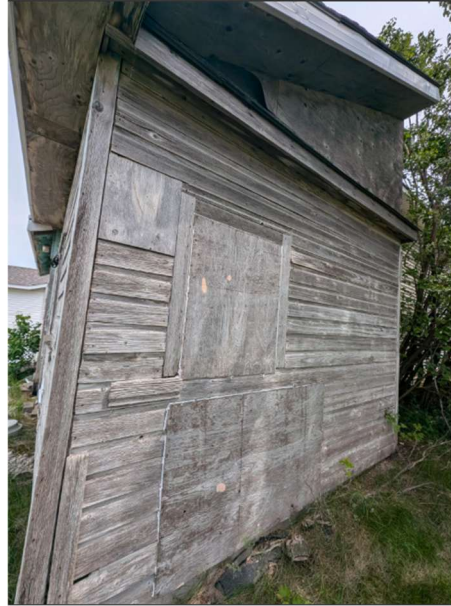
West Side Panel ( Facing East )