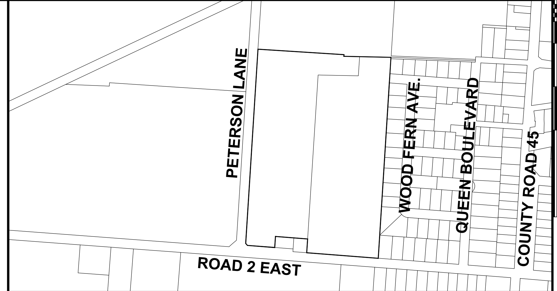
KEY PLAN (NTS)