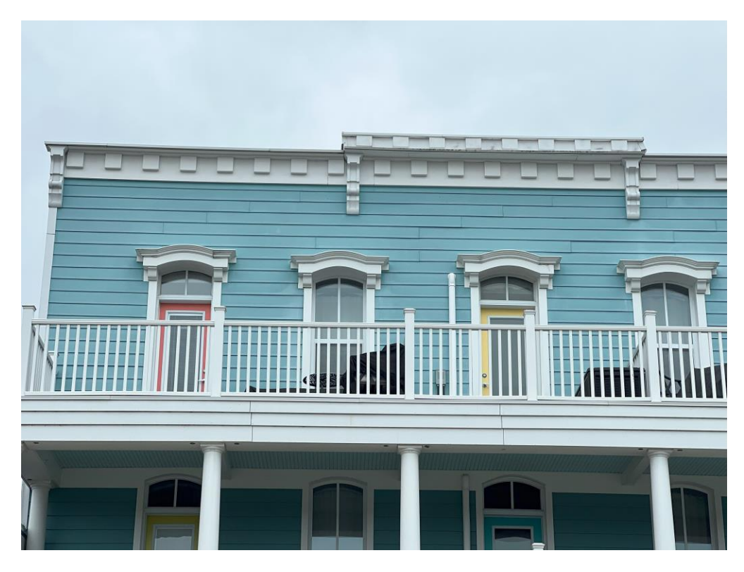
Window Toppers, Dentil Mouldings, Corbels etc.