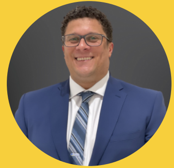
Dennis Rogers Mayor