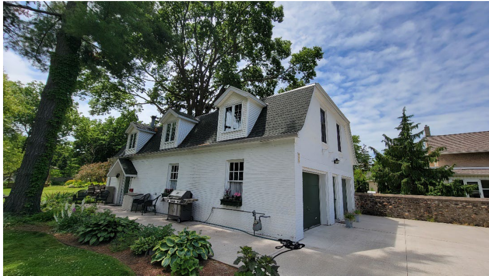
Colonial Architectural Style