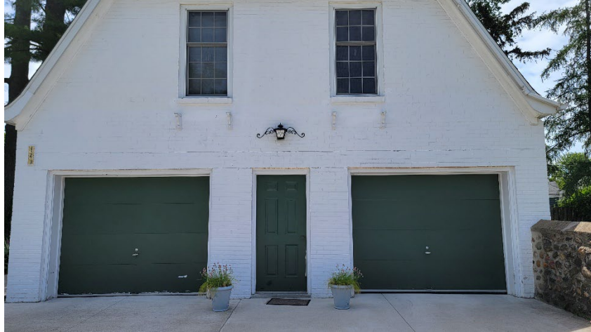
Symmetrical Garage Doors