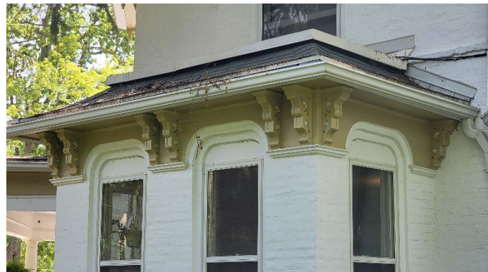
Wooden Cornices and Trim