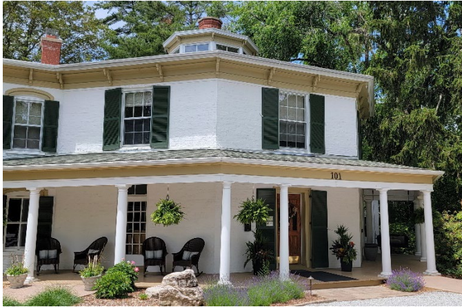
Octagon Architecture Style