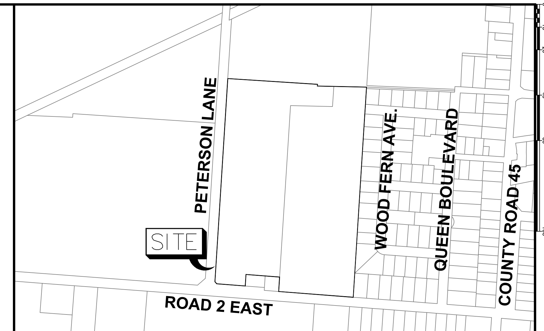
KEY PLAN (NTS)