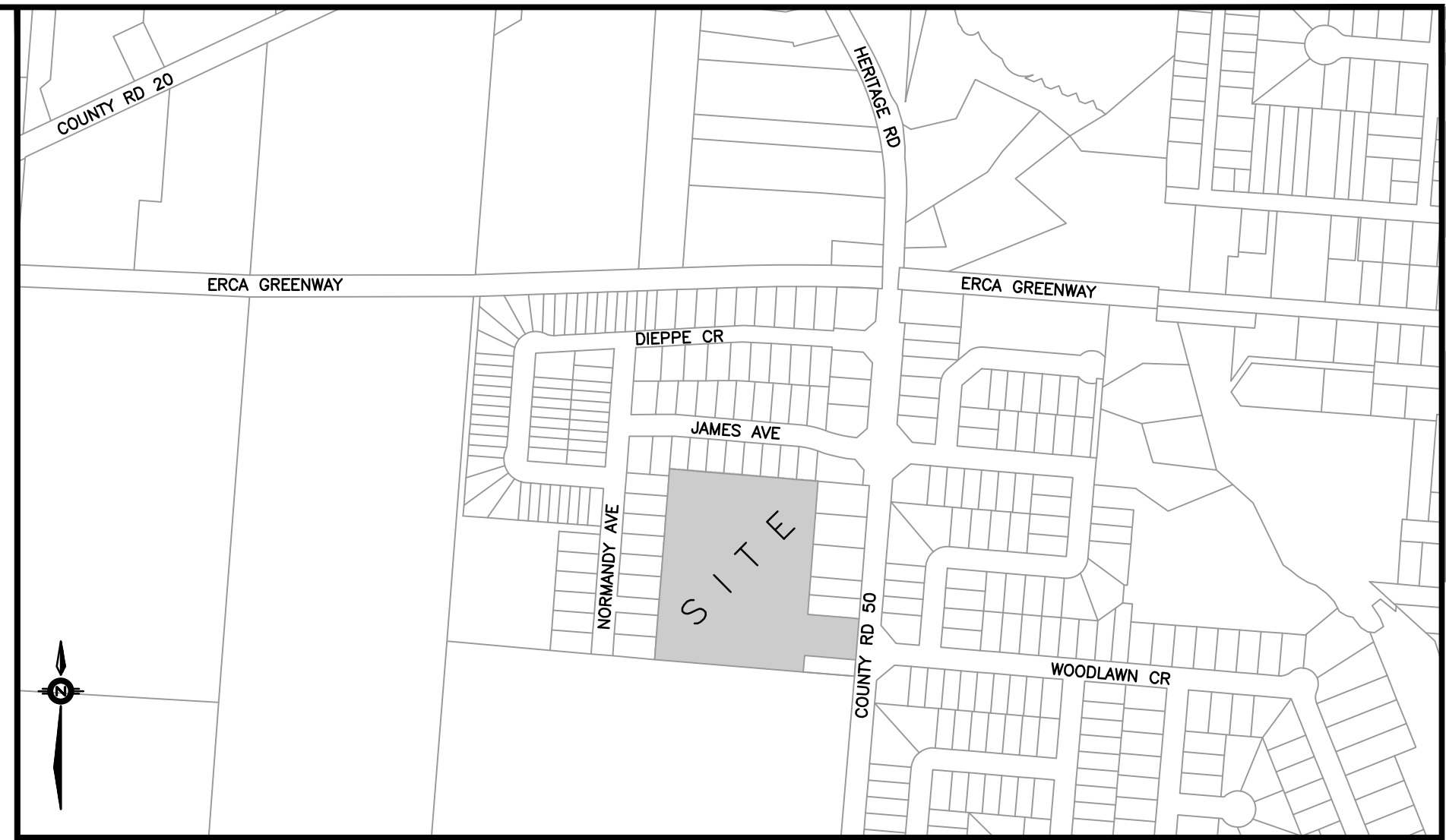
KEY PLAN (N.T.S.)

PART OF LOT 4 CONCESSION 1 WESTERN DIVISION (GEOGRAPHIC TOWNSHIP OF GOSFIELD SOUTH) IN THE TOWN OF KINGVILLE IN THE COUNTY OF ESSEX, ONTARIO