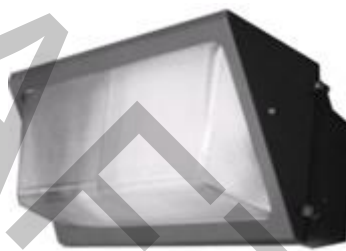
FIGURE 5: PROHIBITED WALL MOUNT