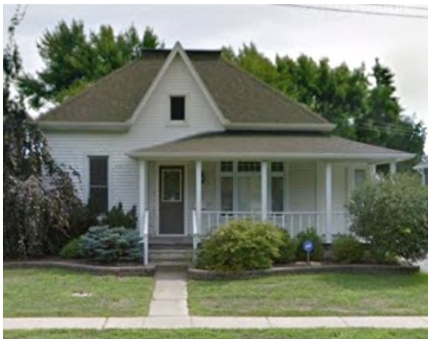
135 MAIN STREET EAST Gothic Cottage — 1897