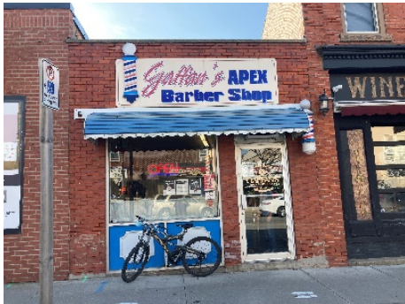
21 MAIN STREET EAST Pre-Modern — 1909

value should cover as little of the façade as possible.