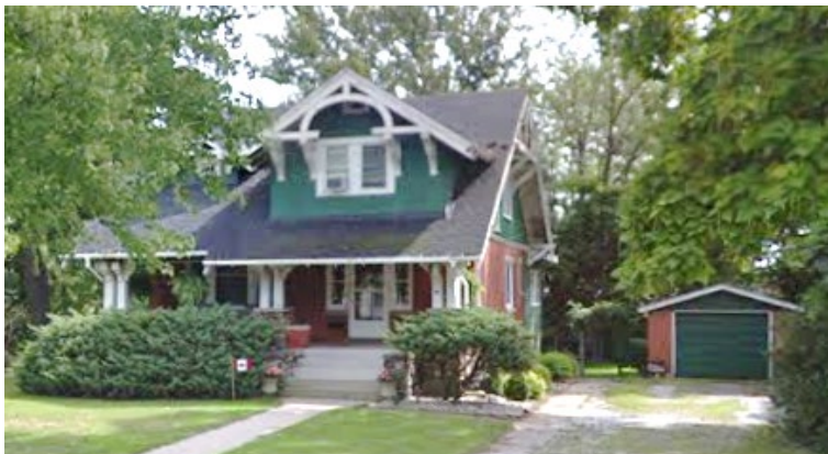
93 MAIN STREET EAST Craftsman — 1915

This single-storey brick building was erected by Charles Fields in 1909.