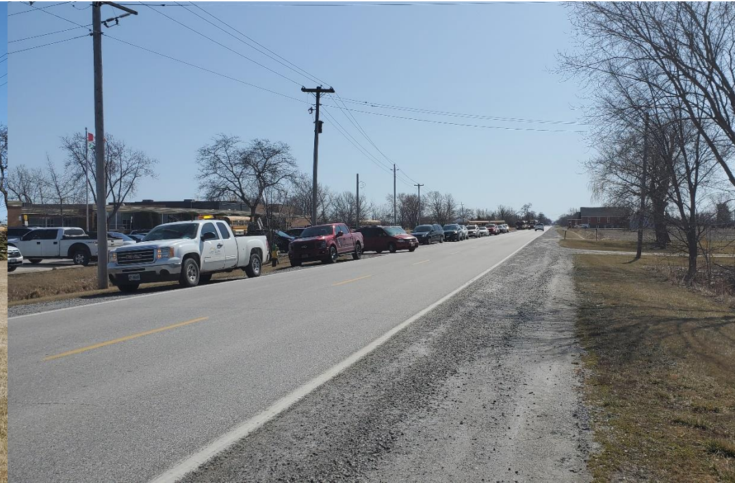
4- at afternoon dismissal- occupied shoulder and obstructed sightlines