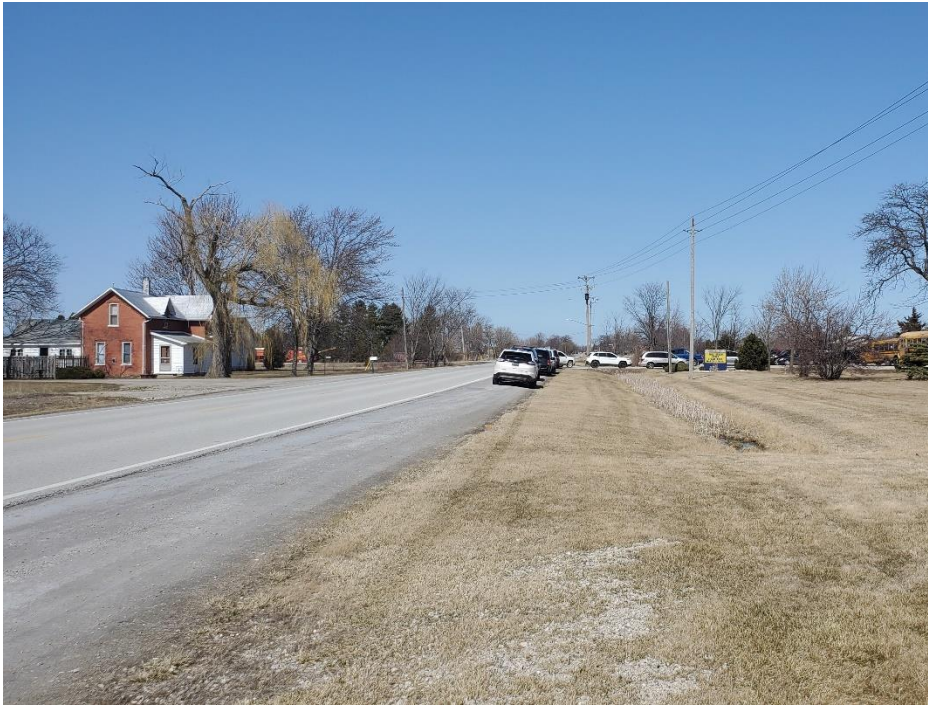
3- at afternoon dismissal- shoulder is getting occupied