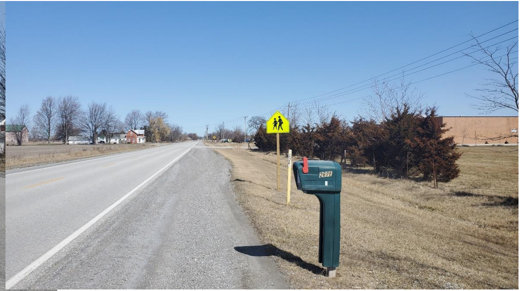
2- before afternoon dismissal- clear shoulder