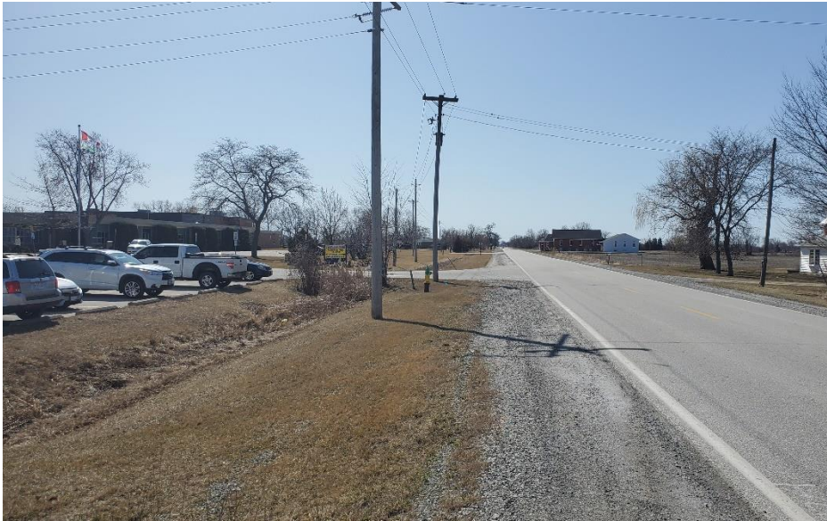
1- before afternoon dismissal- clear sightlines- clear fire hydrant