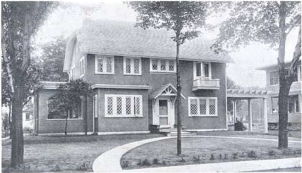
ALADDIN DWELLING THE BRENTWOOD