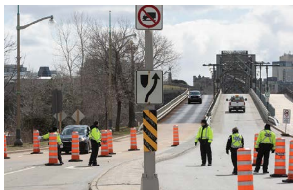
The Gatineau Police Department controls movement at the entrance to the territory.