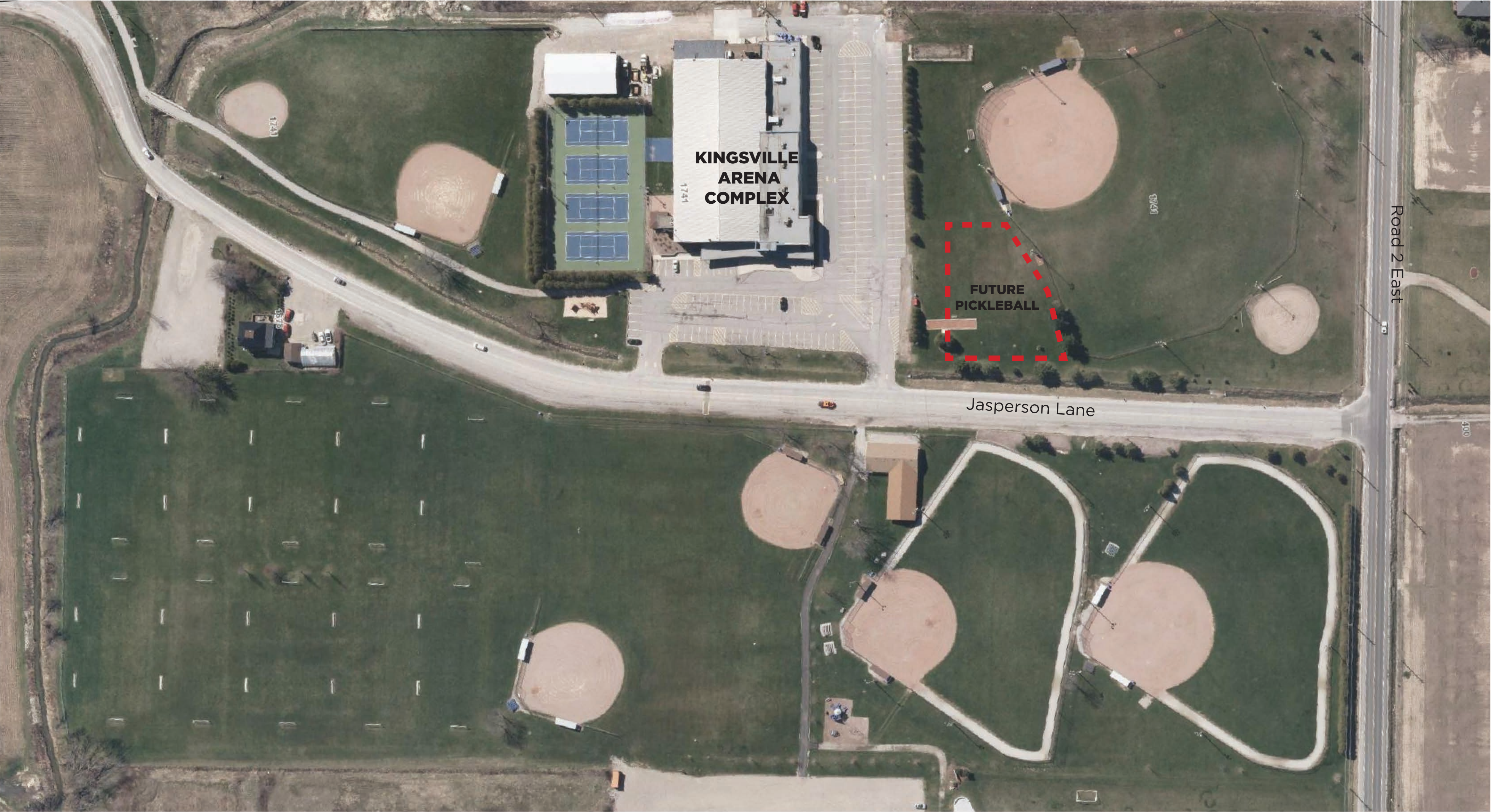
SCALE = 1:1000